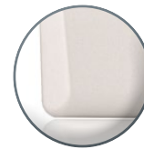
B100PROXS-MF-SA Silver - ABS