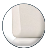
MTS-LCD Silver - ABS