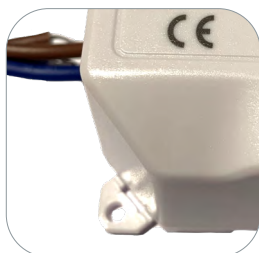
Fixing for surface mounting