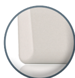
MTPXS-MF Silver - ABS